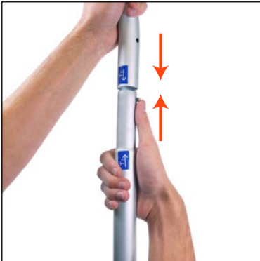
1. Assemble Frame perimeter in order of the stickers.

Assembly is the same for all sizes of standard Renew Banner Stands.