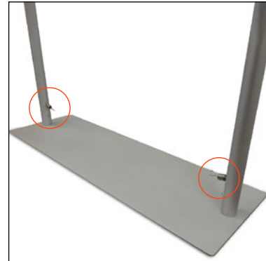
Note: The spring hooks in each corner will not be used.