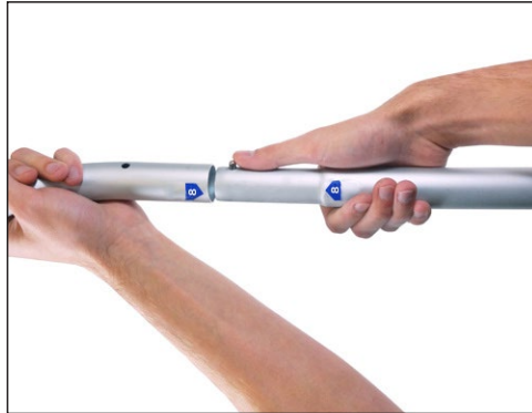
2. Connect large bungeed poles to corners, matching up stickers.