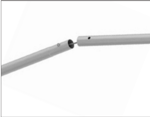
1. Assemble bungeed poles.

Note: Assembly is the same for all sizes of curved Helium displays