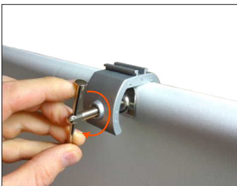
6. Attach optional light clamps to the top bar in desired locations. Tip: It is easier to do this before standing the display up.