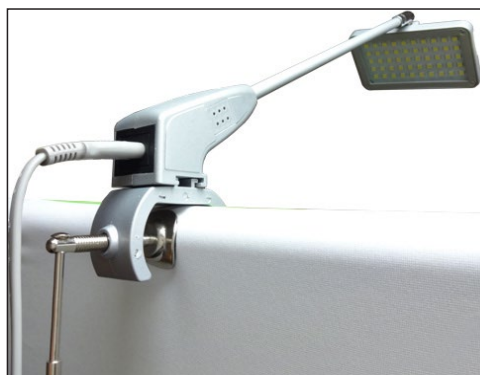
7. Connect LED lights to the clamp.