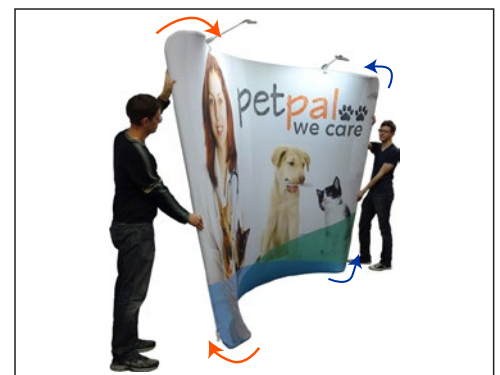
8. Straighten the frame. Have two people hold the sides of the frame, then gently twist until straight.